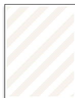
Run of Book 210 x 280 mm CHF 14,000