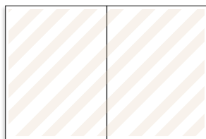
Run of Book 420 x 280 mm CHF 20,000