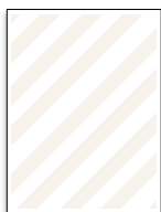
Back Cover 210 x 280 mm CHF 34,000